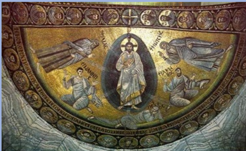
The Transfiguration (Luke 9) (Mosaic at St Catherine's Monastery, Mt Sinai)

www.standrewskentct.org * 860.927.3486 * st.andrew.kent@snet.net